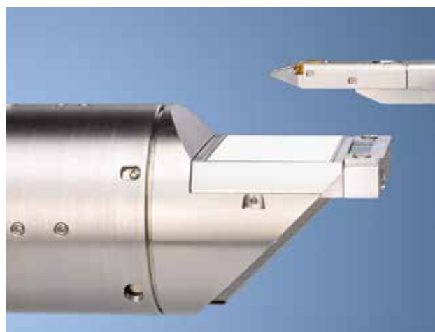
OPTIMUS™ TKD detector head below a sample

Unique sample-detector geometry: OPTIMUS™ TKD detector head positioned underneath the Bruker TKD sample holder containing an electron transparent sample. The integrated ARGUS™ imaging system with its characteristic three Si diodes is visible at the front of the detector head.